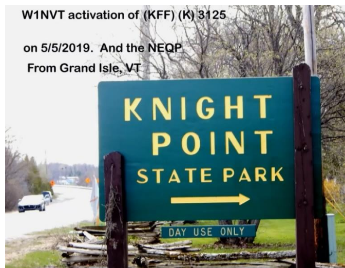
VPOTA - Knight State Park

On May 5 th , RANV ( W1SJ , KB1FRW , AB1DD , and K1BIF ) activated Knight Point (KFF3125) and participated in the New England QSO Party from Grand Isle. The weather was great and we made 728 contacts in 6 hours with 2 stations!