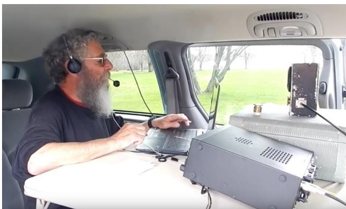
Carl AB1DD Operates from Knight State Park