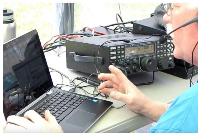
Bob KB1FRW Operates from Knight State Park

On May 5 th , RANV ( W1SJ , KB1FRW , AB1DD , and K1BIF ) activated Knight Point (KFF3125) and participated in the New England QSO Party from Grand Isle. The weather was great and we made 728 contacts in 6 hours with 2 stations!