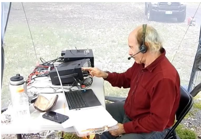
Mitch WISJ Operates from Knight State Park