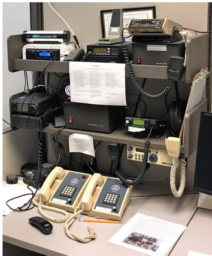
WX1BTV Station