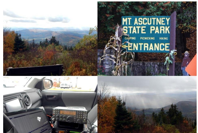
Ascutney SP

A mere 6 days later, we were at Near-Fest. The plan was to activate Mt. Ascutney State Park on the way home. Bob K1BIF drove down from Colchester and got things going while Bob KB1FRW raced out of the fest and headed for the park. We finally got there at 2:30 and Bob quickly installed me on 20 meters while he took a much needed break after a 2 ½ hour run. We got 40 meters going just before 4 - a much later start than normal because we were on the road. But 40 was madhouse with folks already looking for us and the Pennsylvania QSO Party going on. Eventually the 3 of us logged 407 QSO's in a short operation which featured both sunshine and snow showers on the mountain.