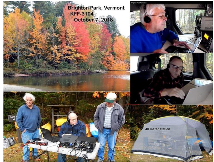
Brighton SP

was cold but the DX conditions were spectacular! It was a full on European onslaught on 20 meters. Half our contacts were DX! One of the Newport hams got on the air and commented that those guys don't use proper phonetics! Yes, and they all have just a slight accent! When the battle was over, 573 QSO's appeared in the logs.